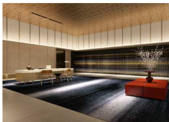
Artist's rendering of the arrivals lobby